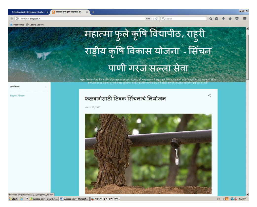
Home screen of blog